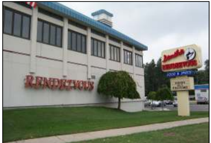
The Dimitri's Rendezvous on Gratiot south of Metropolitan Parkway will host an upcoming DDA Breakfast Meeting on April 22.

Agenda topics include a review of the Special Lighting District and the future installation of LED lights along the corridor from 14 Mile Road to north of Metropolitan Parkway. Currently, property owners with more than 45 percent of the lineal feet along the corridor have approved of the project. More than 50 percent of those owners will